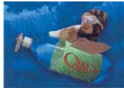
2005 CAN Holiday Card